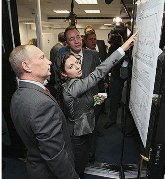
Simonyan shows RT facilities to then Prime Minister Putin. Simonyan was on Putin's 2012 presidential election campaign staff in Moscow (Rospress, 22 September 2010, Ria Novosti, 25 October 2012).