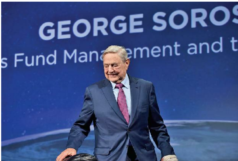
George Soros, billionaire investor and backer of President Obama. As the Obama administration "smashed" energy companies, Soros "grabbed" shares on the cheap. Other Obama insiders did the same.